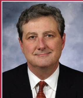
John Kennedy, State Treasurer President, LAMP, Inc.

You are cordially invited to Louisiana Asset Management Pool, Inc.'s 2013 Annual Meeting October 24-25, 2013 in Lafayette